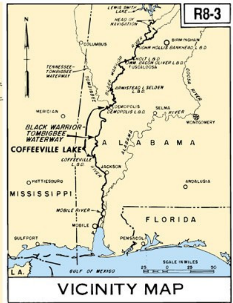
BLACK WARRIOR & TOMBIGBEE RIVERS, ALABAMA